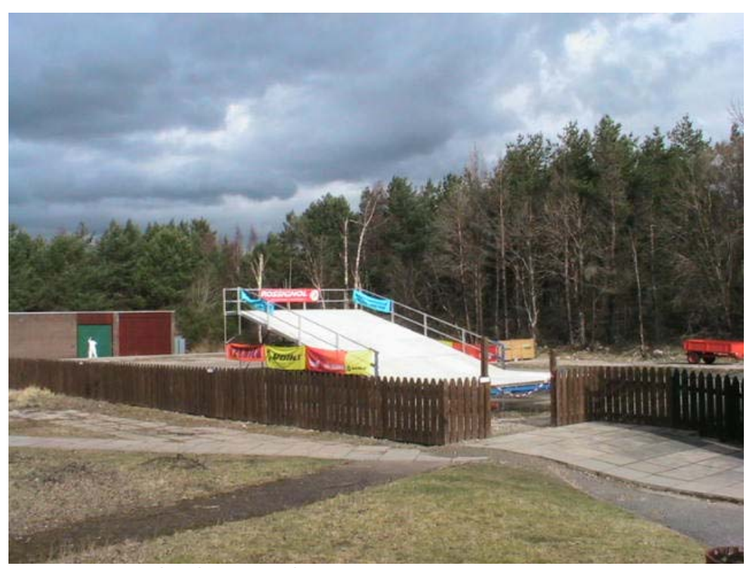
Fig 2 Portable Ski Slope on Site